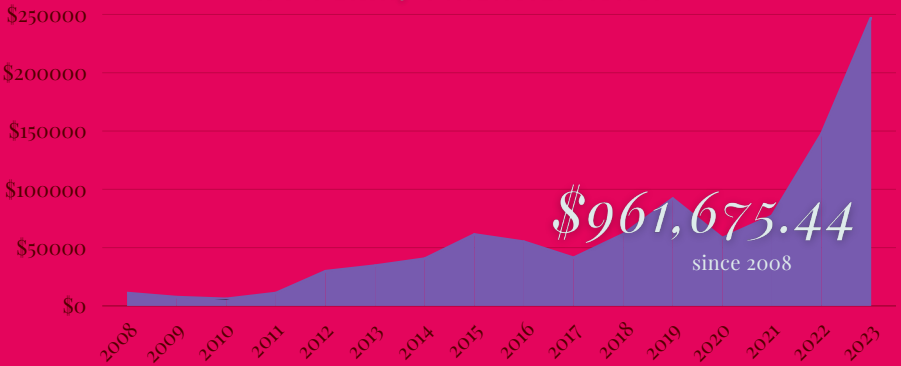
AFF Family Financial Relief